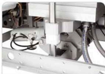
Hygienic pneumatic lifting systems