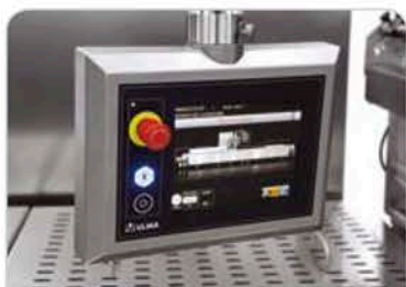
Operator friendly interface