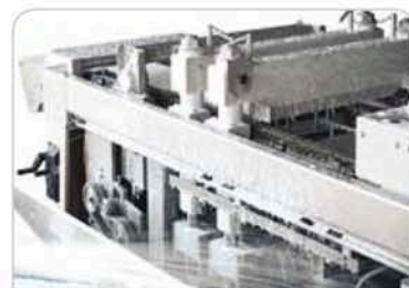
Ultimate hygienic design