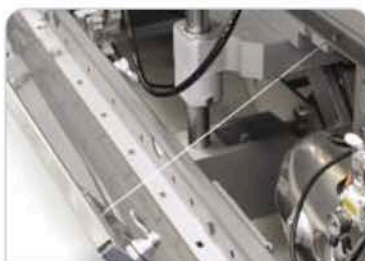
Quick and easy access